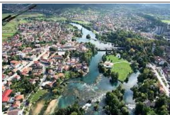
Bihać - panorama

Refuge is managed by an association of citizens "Velebit Association Kutarevo" and volunteers from Croatia and abroad.