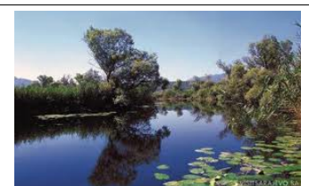
Hutovo Blato, nature national park

It is a village-town (kasaba) in the south-eastern region of the Mostar basin. Blagaj stands at the edge of Bišće plain and is one of the most valuable mixed urban and rural structures in Bosnia and Herzegovina. The natural and architectural ensemble of Blagaj is on the Tentative list to be declared a UNESCO World Heritage. It is situated at the source of the Buna river (the largest source in Europe), where there is also historical tekke (tekija or dervish monastery). Tekija in Blagaj was built around 1520, with elements of Ottoman architecture and Mediterranean style and is considered a national monument.