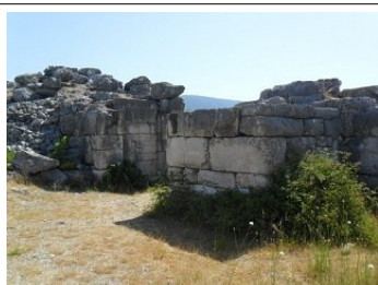
Daorski Fort

Hutovo Blato: this national Nature Park is one of the largest Winter bird ports in Adriatic region. The landscape of Hutovo Blato is quite unique with lost rivers, valleys and gorges, with some lakes below the level of sea creating true crypto depressions. A green paradise with an abundance of plant life spanning swampland, meadows and forest. One such project has determined through their research, that the favorable environmental conditions and influence of Mediterranean climate, more than 600 floral species were identified in the nature park.